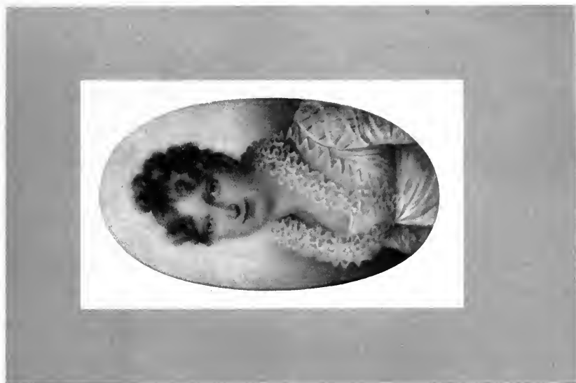
THE EMPRESS MARIE LOUISE BY JEAN BAPTISTE ISABEY